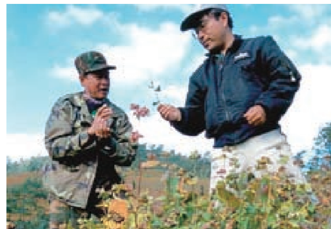
A JICA expert providing guidance on buckwheat cultivation techniques to a counterpart