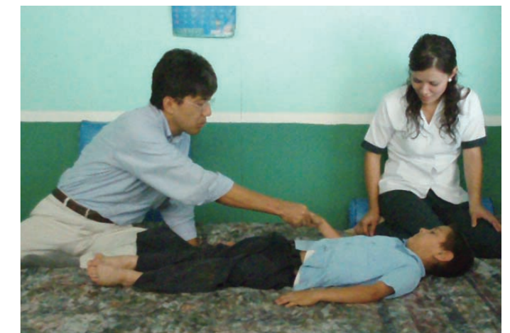
A JICA expert supervising a child who receives physical therapy treatment in a primary school