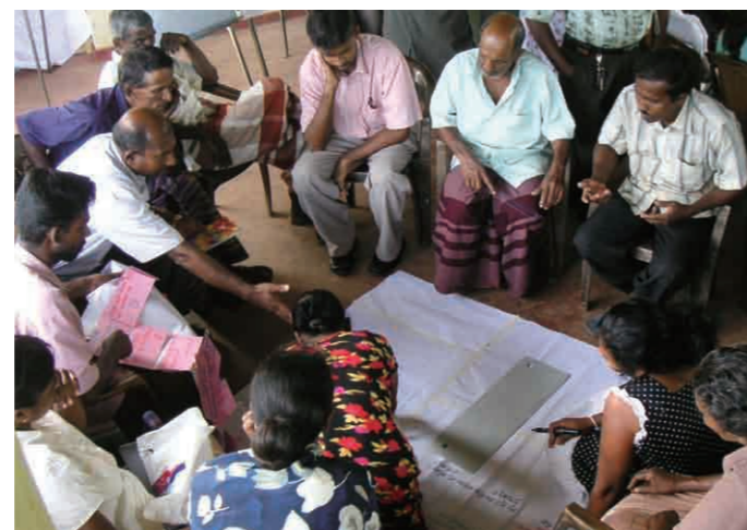
Villagers formulating a Community Action Plan (CAP) in a workshop

The southern district of Hambantota has one of the harshest living environments in Sri Lanka. It is difficult to secure water for agricultural and daily use due to the low annual rainfall. As a result, the population has to depend on its water supply from water tanks and government-operated water bowsers. Despite the redundant labor force in farm households, they have few other choices apart from engaging in agriculture on limited plots of land.