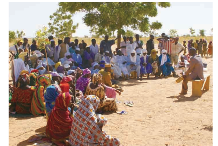
Villagers talking about the future of their children at a COGES general assembly