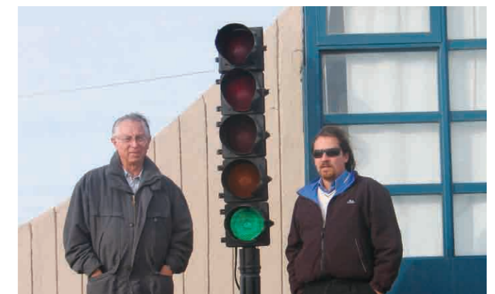
The "UV-level warning signal" announces the risk level of UV-ray exposure to local people in an easily understood manner. Safe days are indicated by a green lamp, relatively risky days by a yellow lamp, and high exposure risk by a red lamp.

In addition, the "Project Designed to Strengthen the Capacity to Measure the Ozone Layer and UV Radiation in Chilean-Argentine Southern Patagonia and the Projection towards the Community" (October 2007 - September 2011) implemented jointly with related institutions in neighboring Chile, has succeeded in strengthening significantly the system for providing the necessary data for assessing the state of the ozone layer. This data is linked to a "UV-level warning signal" system that announces the risk level to residents through easy-to-understand signals. In order to raise the local people's awareness of the invisible threat posed by UV rays, activities are carried out instructing them to wear long sleeves and sunglasses, and to prevent children from playing outside on the days when the lamp is red.