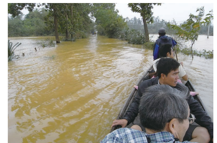
Project members moving across a flooded village road by boat