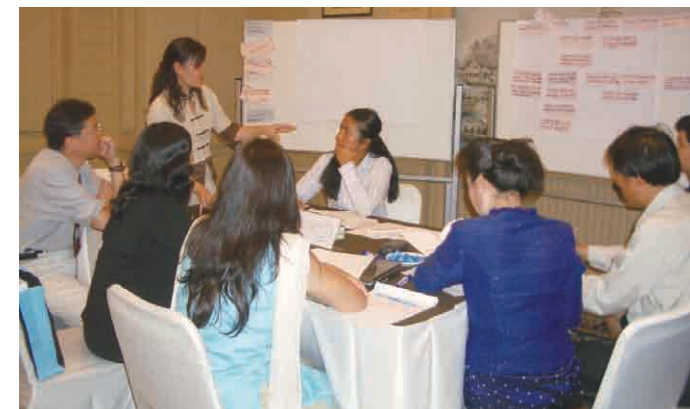
Participants from various countries analyzing the major issues of trafficking in persons during the seminar

The issues of trafficking in persons have been mainly approached from the perspectives of international crime prevention and legal system development, thus the trafficked persons have often been treated as the criminals rather than the victims. Instead, it is necessary to prevent people from becoming trafficked victims, protecting those who have