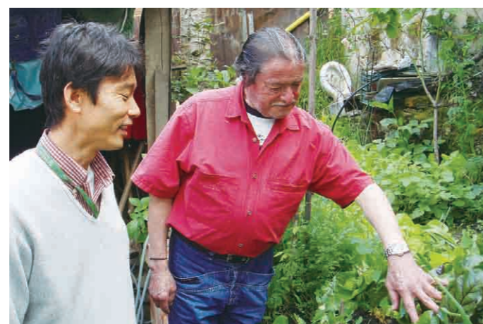
A JICA expert providing advice to local residents in order to enable them to problem-solve through guidance on urban agriculture