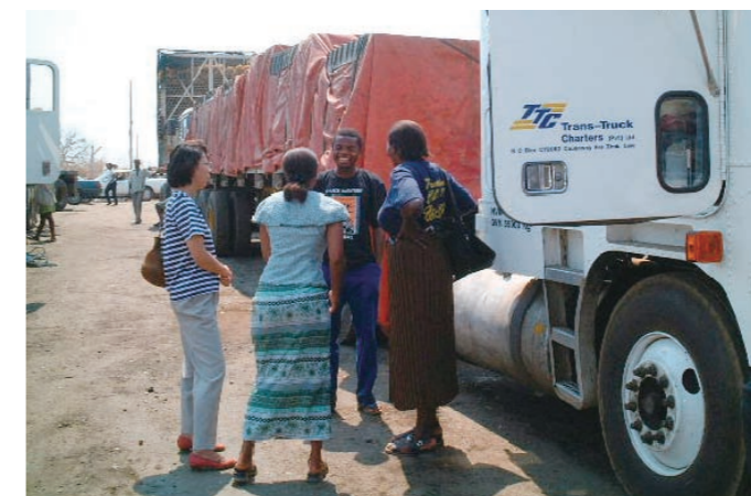
Project members and a JICA expert conducting awareness-raising activities for long-distance truck drivers in Zambia

to Nairobi. JICA has been dispatching Japan Overseas Cooperation Volunteers (JOCVs) to this NGO since 2007. The volunteers engage in the provision of information on HIV/AIDS, and provide support to educational activities promoting changes in behavior, improved nutrition and income enhancement, jointly with community groups. Furthermore, through routine activities such as home visits to HIV-infected patients and cooperation with support groups for HIV-infected patients, they aim to alleviate the stigma and discrimination surrounding people living with HIV and to improve their quality of life.